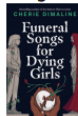
Funeral Songs for Dying Girls Cherie Dimaline