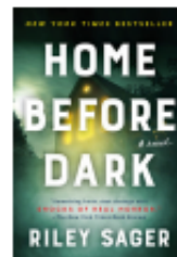
Home Before Dark Riley Sager