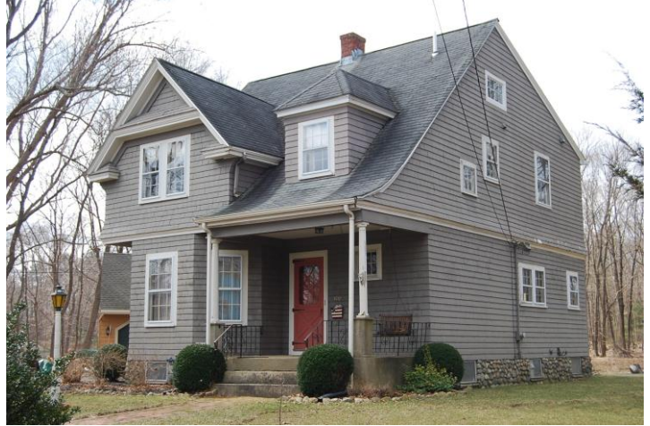
View looking southwest.