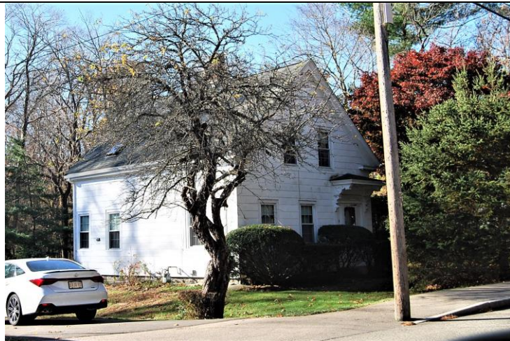
View looking southwest.