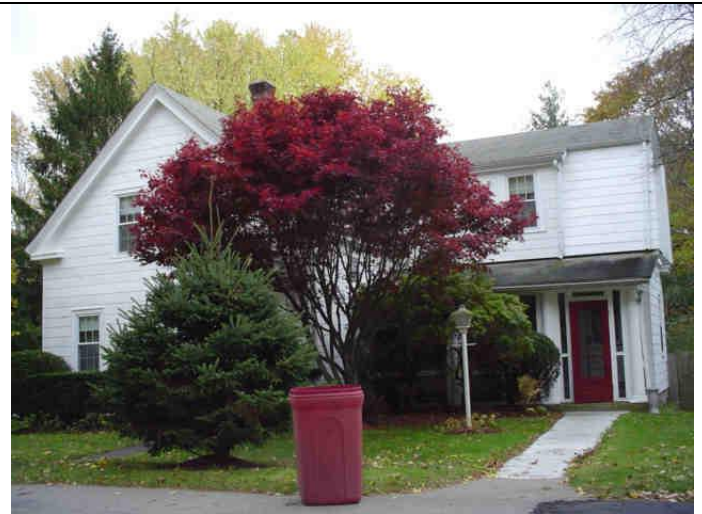
Assessor's photograph showing ell (now obscured by vegetation).