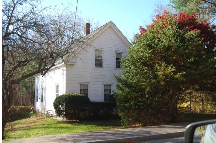
View looking southwest.