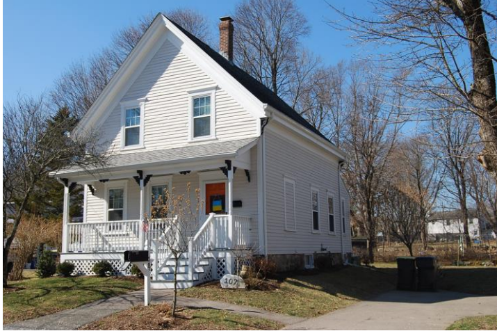
View looking northwest.