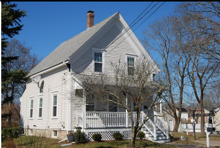
View looking view looking north.