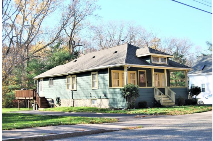
View looking southwest.