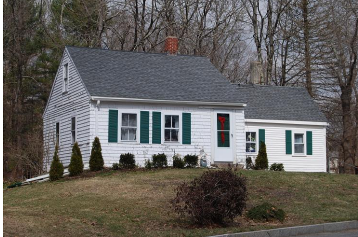
View looking north.