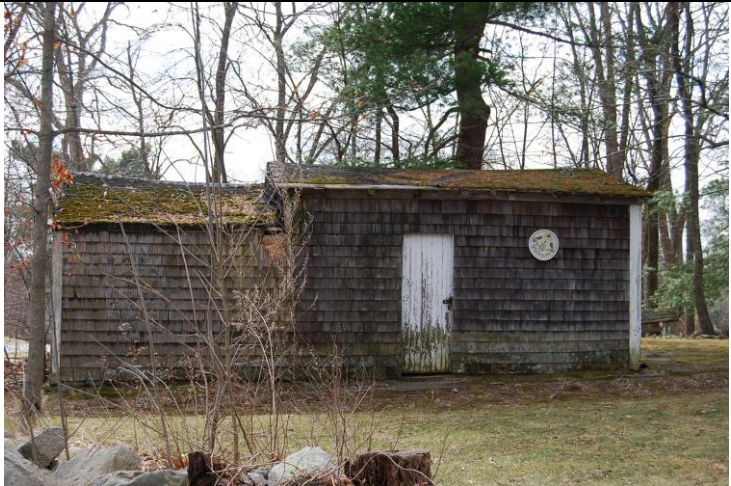
Shed. View looking south.