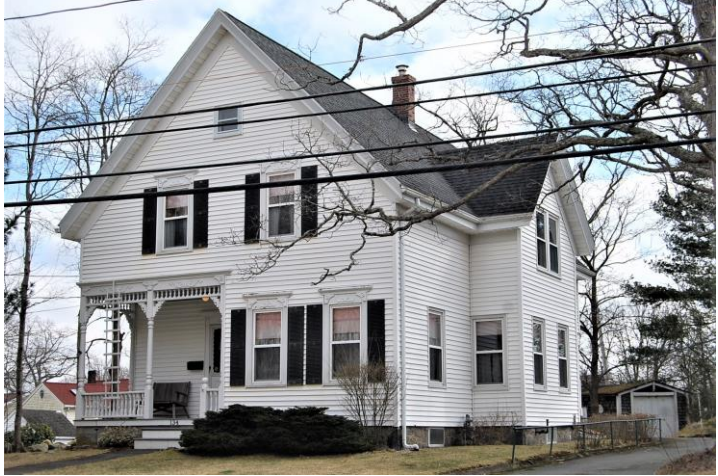
View looking southeast.