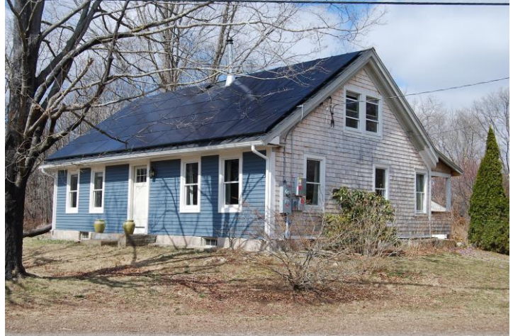
View looking northwest.