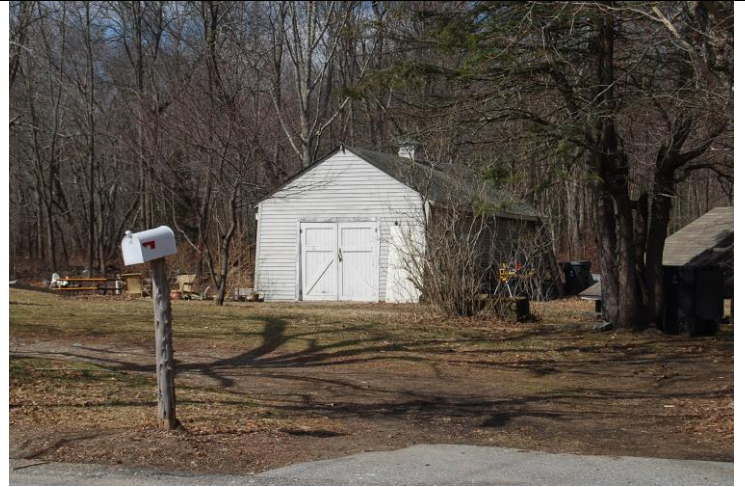
View looking north toward carriage house/garage.