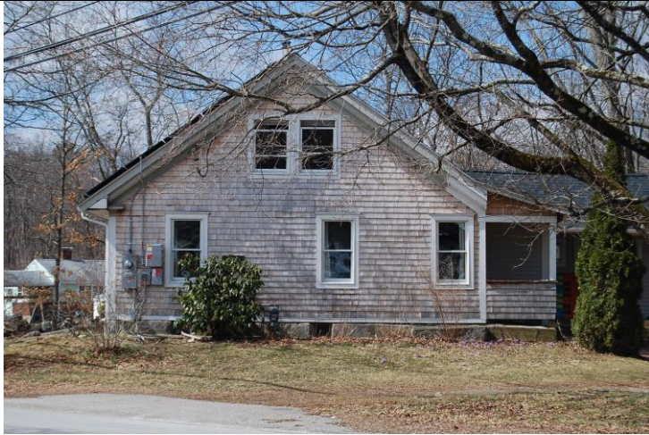
View looking west.