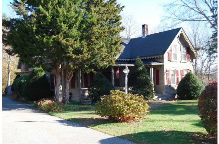
View looking northeast.