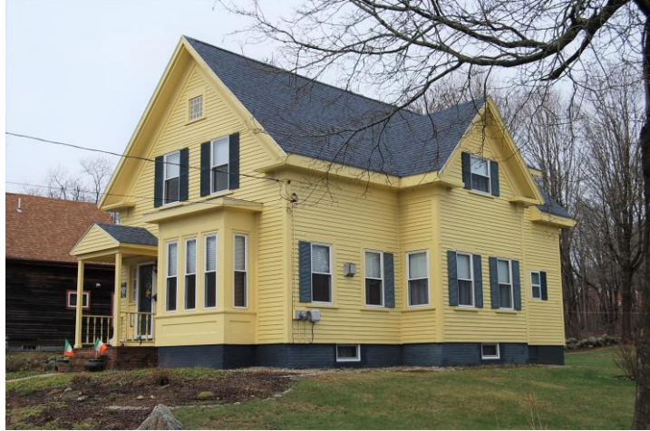
View looking northwest.