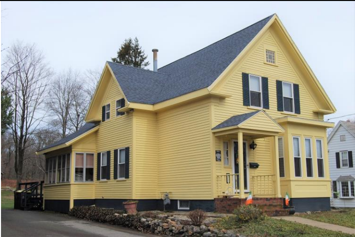
View looking northeast.