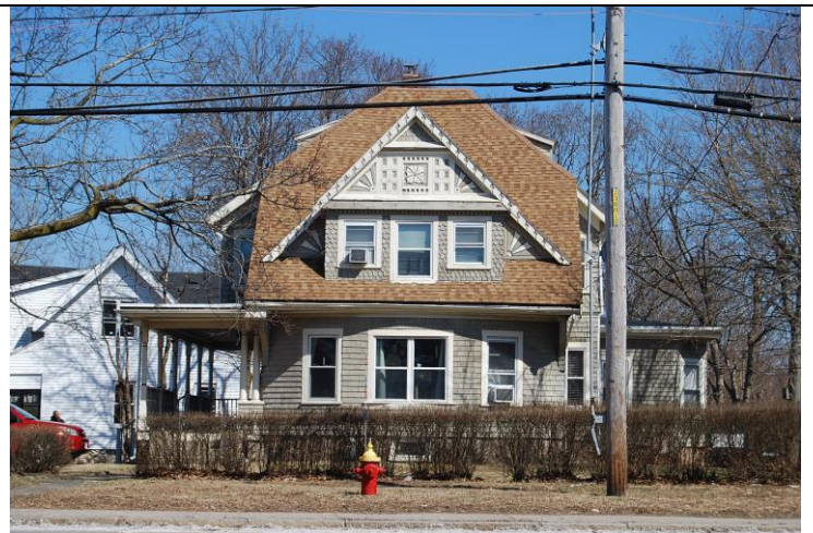
View looking northeast at west elevation.