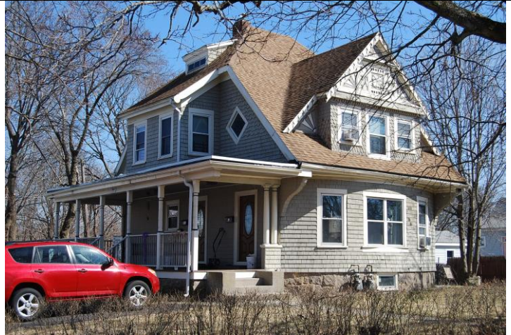
View looking east from corner of East Spring Street and East Main Street.