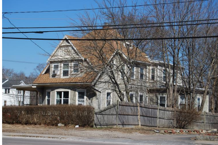
View looking north-northeast from East Main Street.