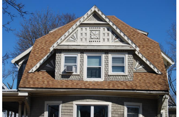
Detail, west elevation.