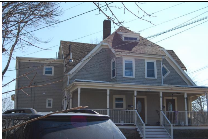
View looking south from East Spring Street.