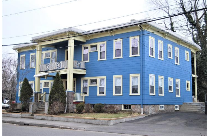
View looking northeast.