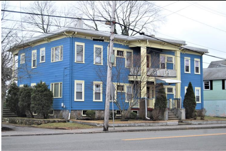
View looking southeast.