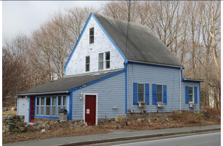
View looking northwest.