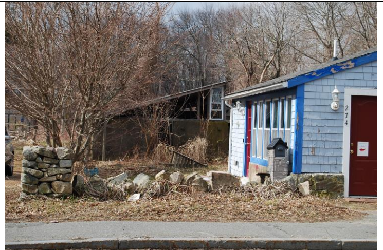
View looking southwest toward shed.