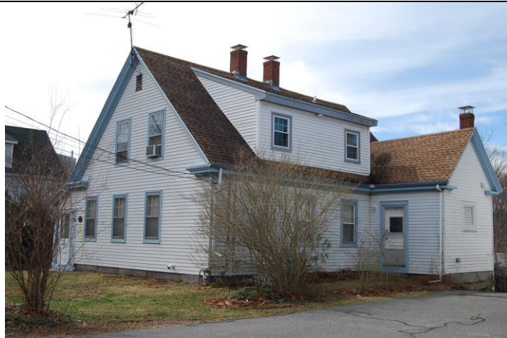
View looking southwest.