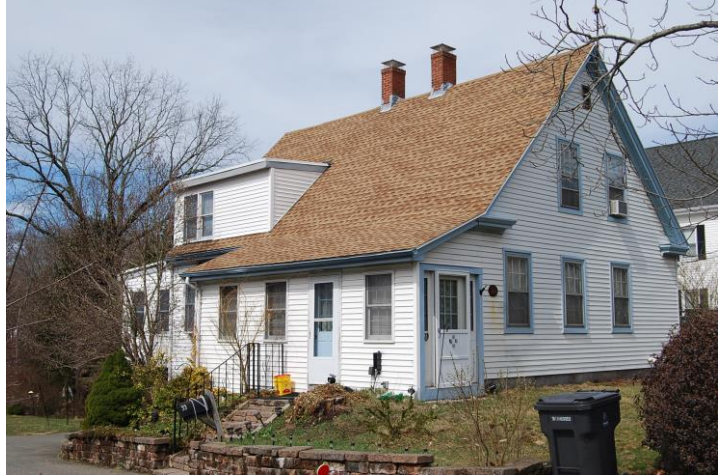
View looking northwest.