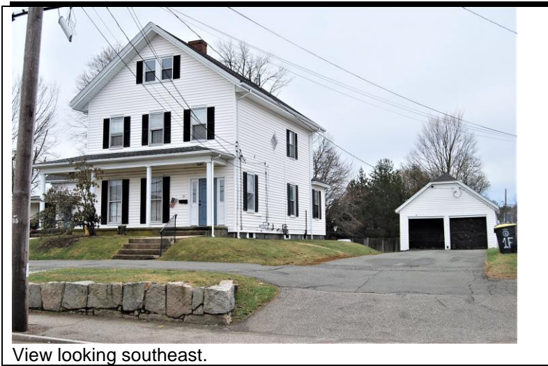
View looking southeast.