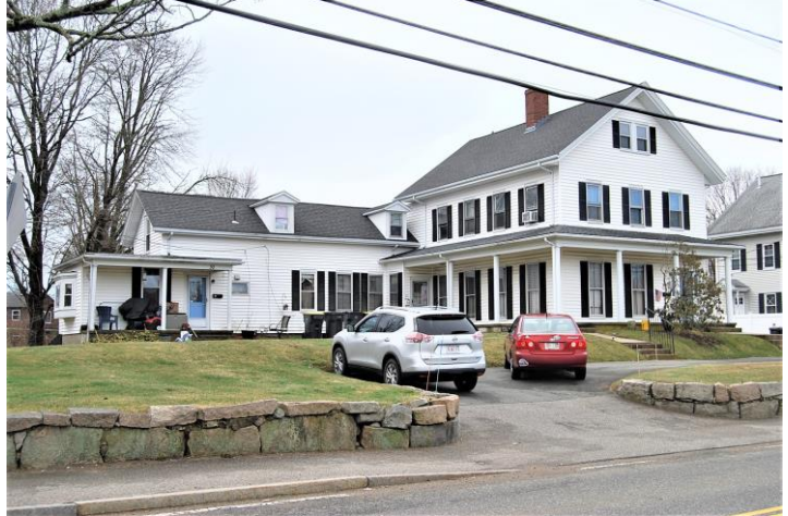
View looking southwest.