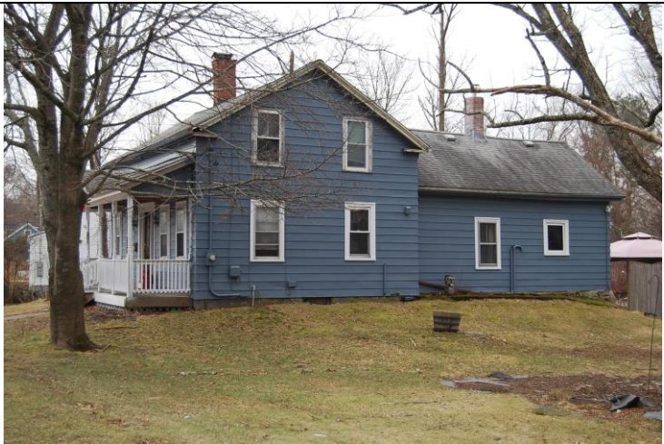
View looking southwest.