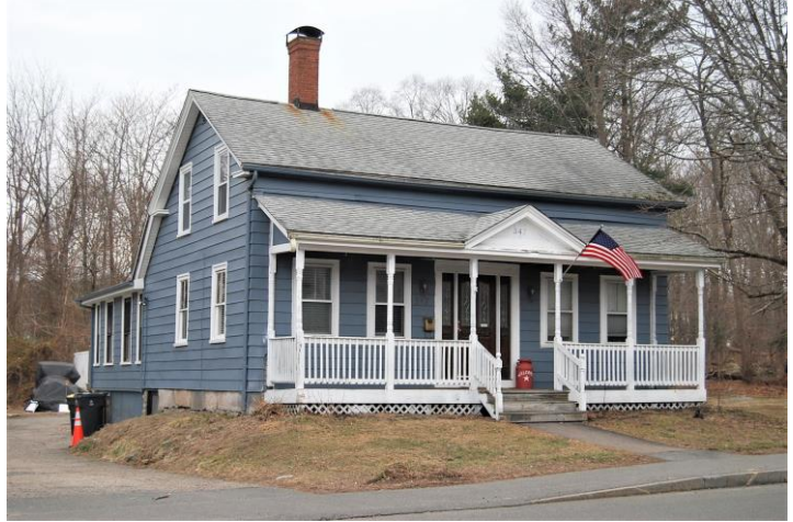
View looking northwest.