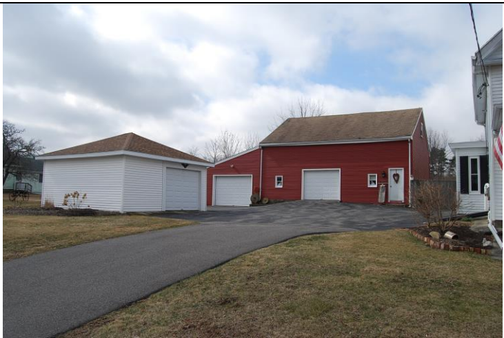
View looking southwest toward garage (left) and barn (right).