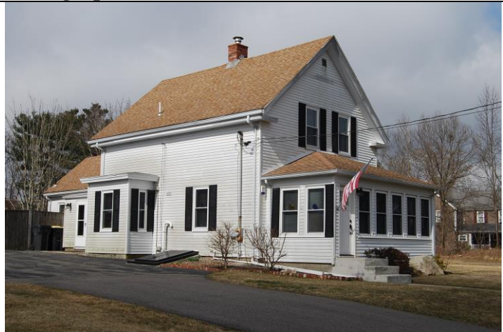
View looking northwest.