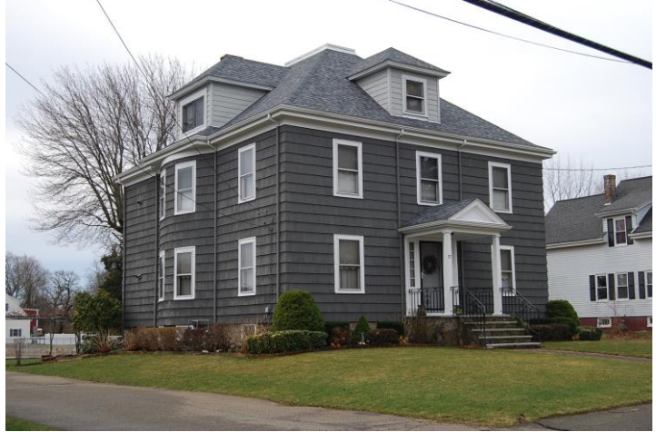
View looking southwest from Bartlett Street.