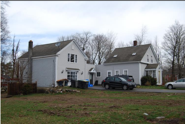
View looking north.