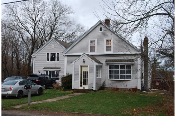
View looking northwest.