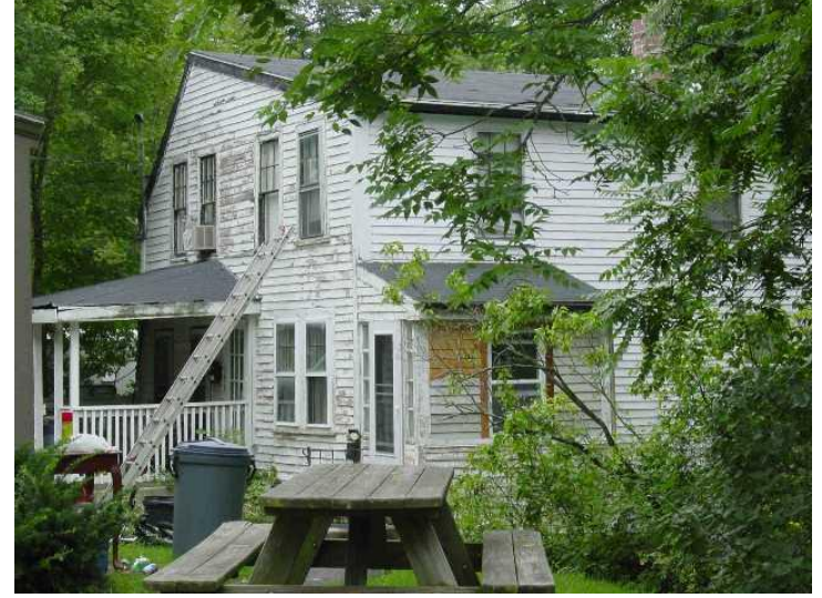
Assessor's photograph of 396 West Main Street.