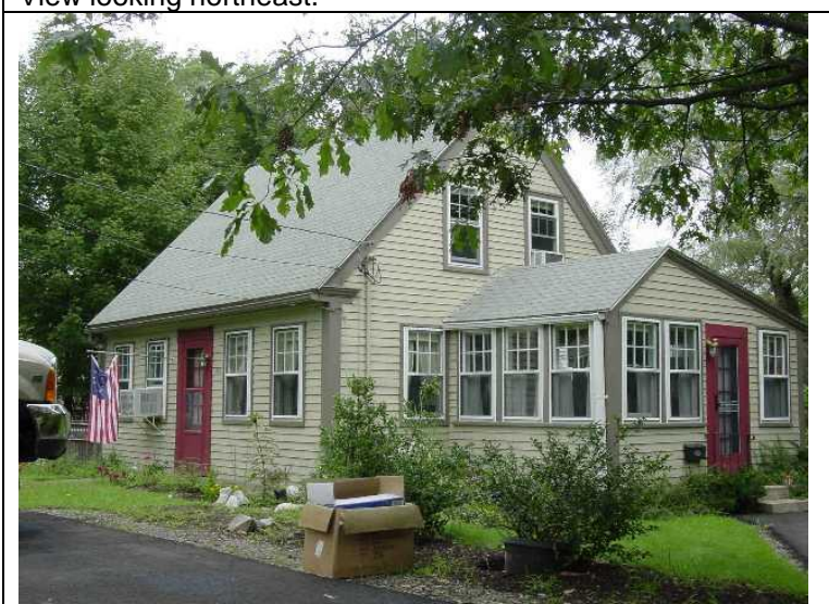
Assessor's photograph of 394 West Main Street.