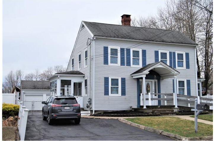
View looking south.