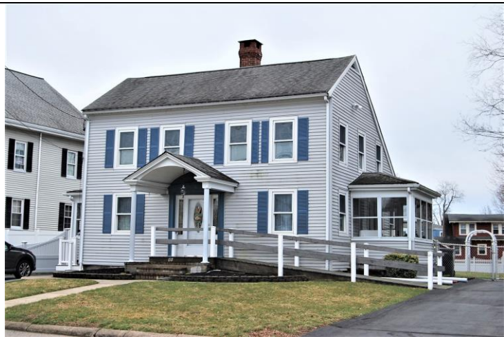
View looking southwest.

World War II Draft Registration Cards. Ancestry.com.