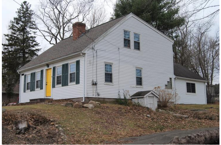
View looking southwest.