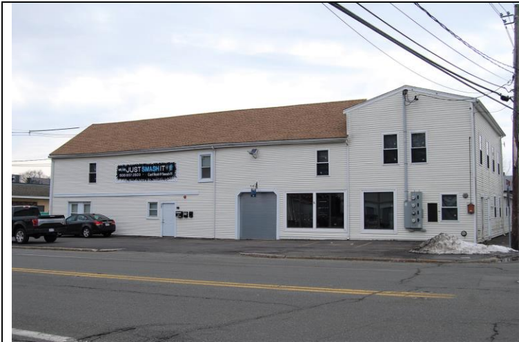
View looking west from East Main Street.