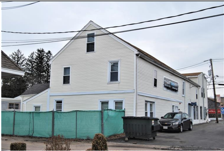
View looking northwest from East Main Street.