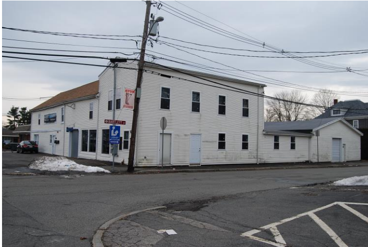
View looking south from East Main Street.