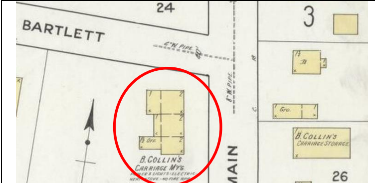
1916 Sanborn Fire Insurance Atlas.