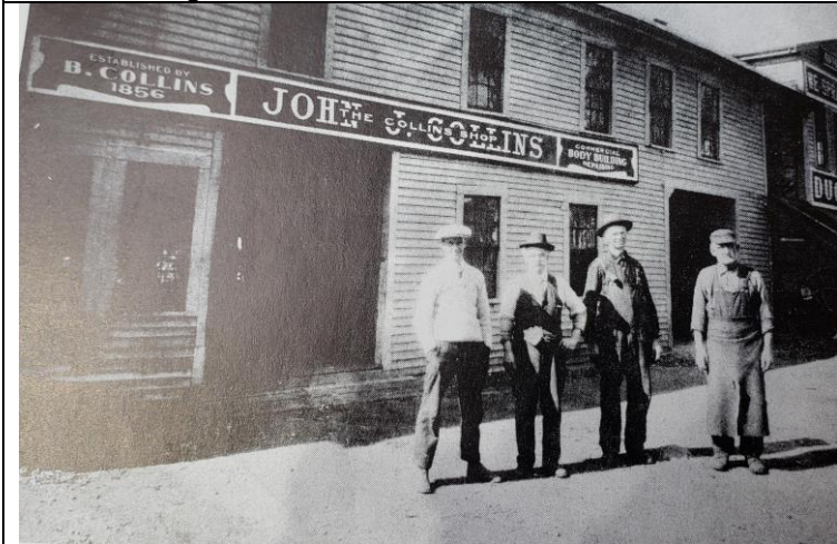
Undated photograph, reproduced in Hanna.