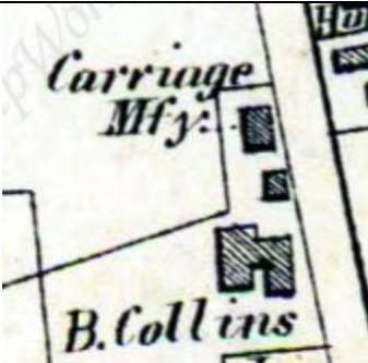
1876 Atlas of Norfolk County.