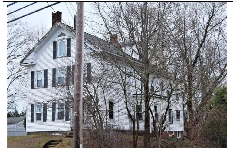
View looking southeast.

World War II Draft Registration Cards. Ancestry.com.