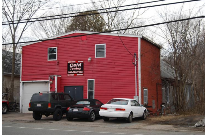
View looking northeast.