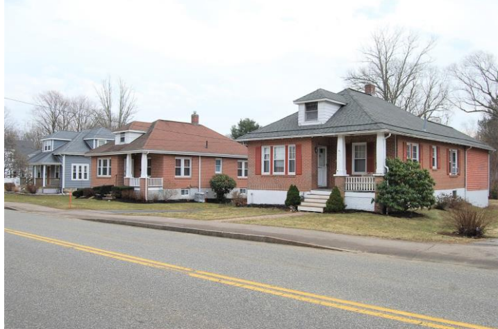
59 East High Street (right) and 63 East High Street (left). View looking southeast.