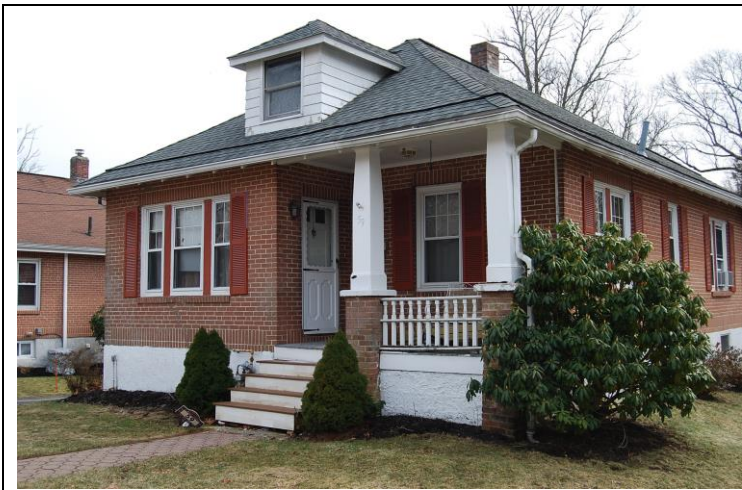
View looking southeast.