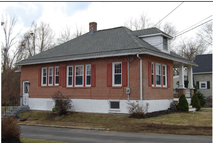
View looking southwest.