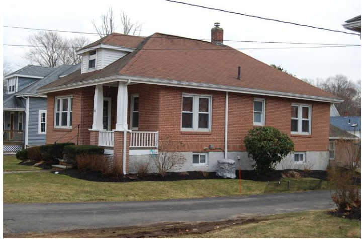
View looking southeast.