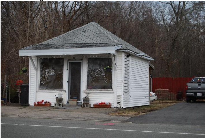
View looking east at shop.