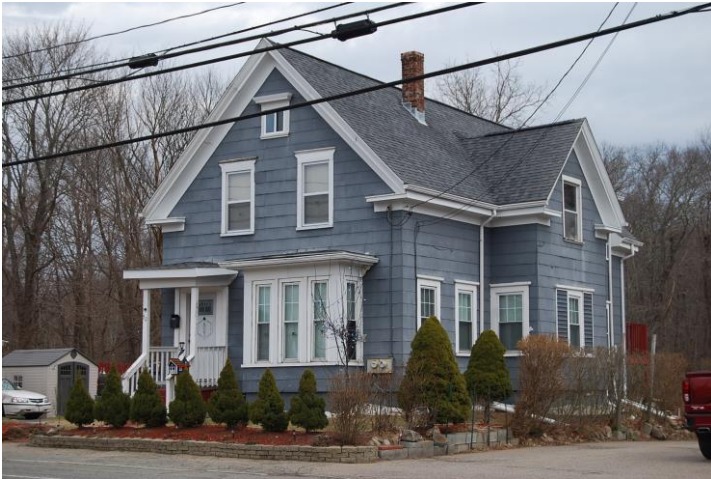
View looking northeast.