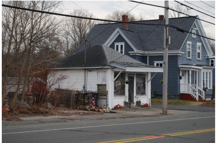
View looking southeast.