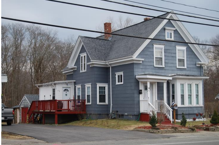
View looking east.