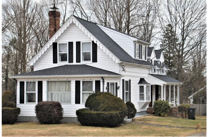
View looking northeast.