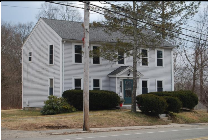
View looking southeast.