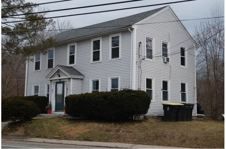
View looking northeast.