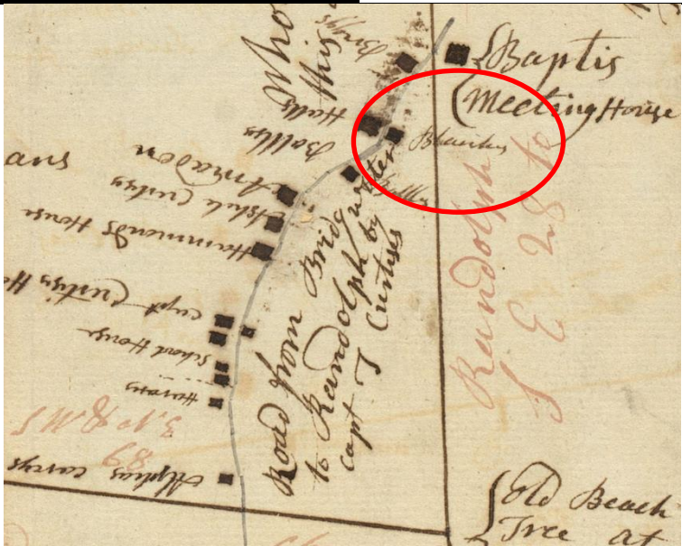
Detail, 1794 Plan of Stoughton.