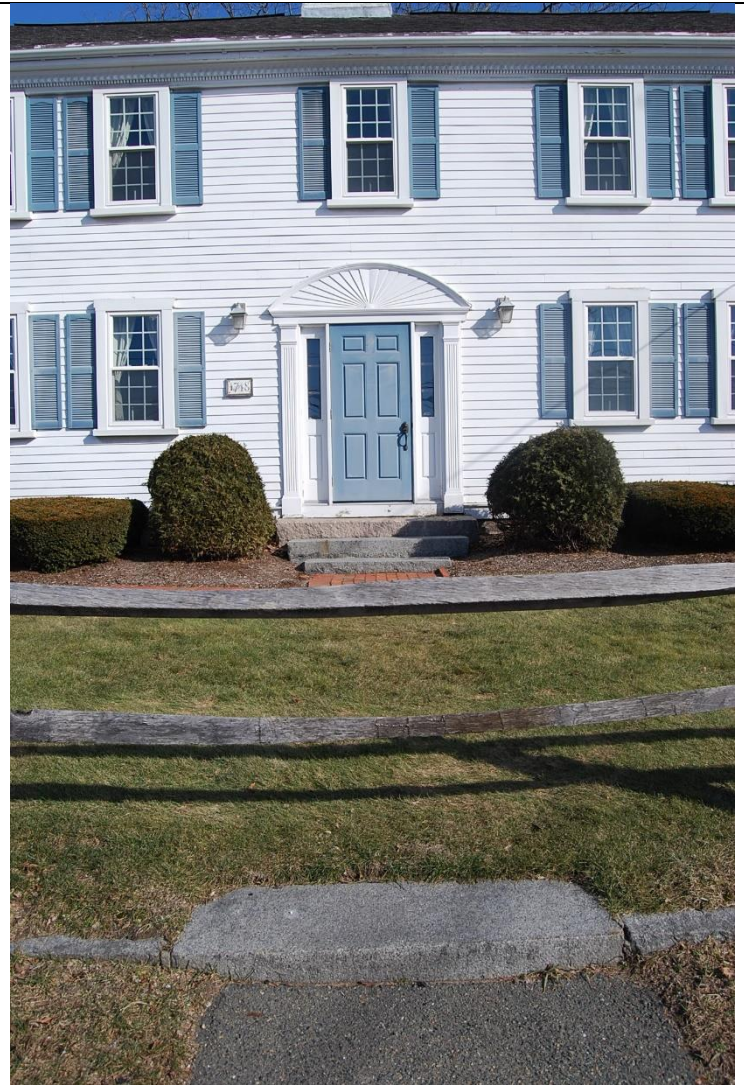
View looking east, showing curb detail and entrance.