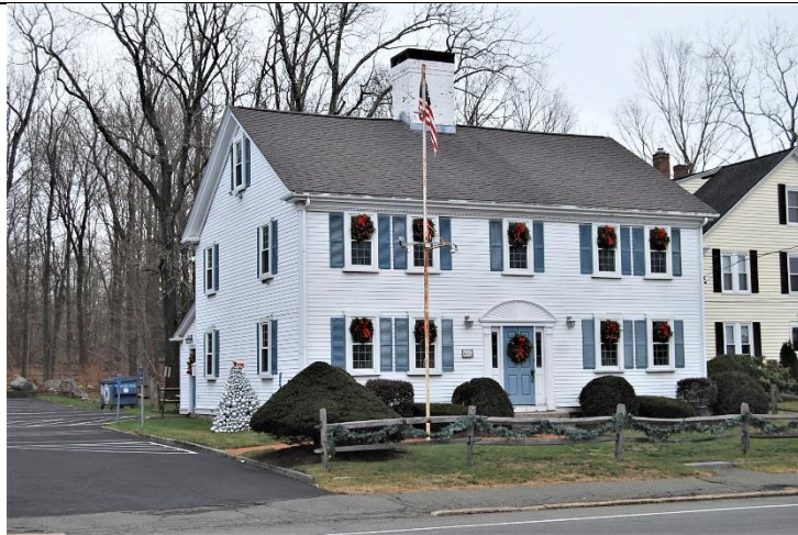
View looking southeast.