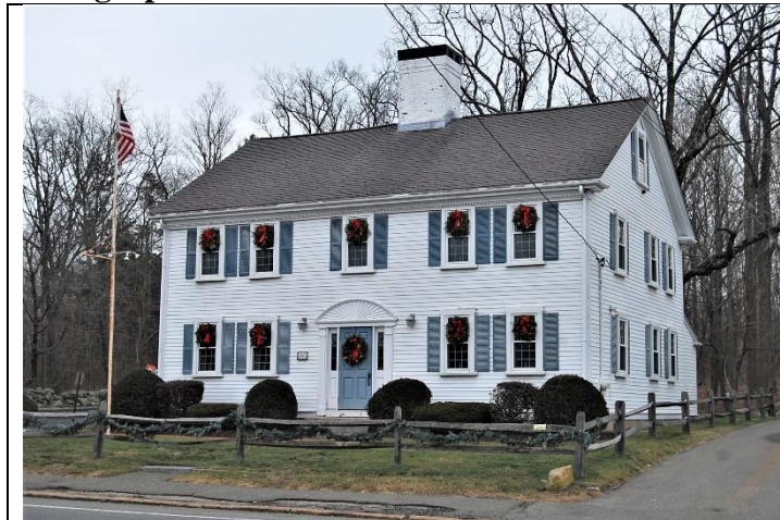
View looking northeast.