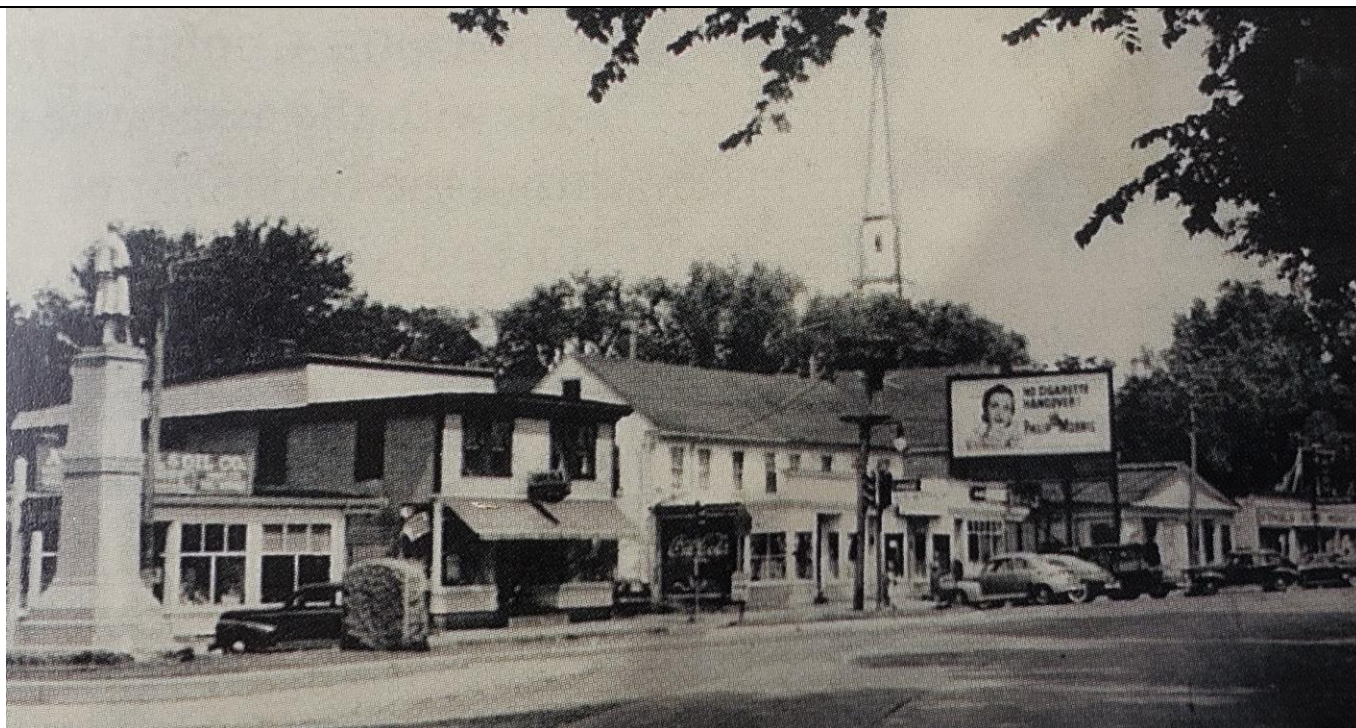
1940s postcard view of Goeres Square. View looking northeast.