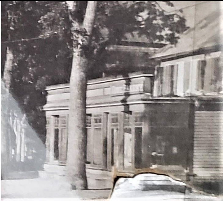
159-1563A Main Street circa 1912. This projecting ell now contains a pizza restaurant.