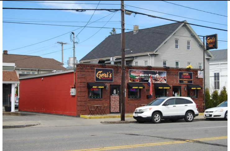
View looking northwest toward 145-147 Main Street.