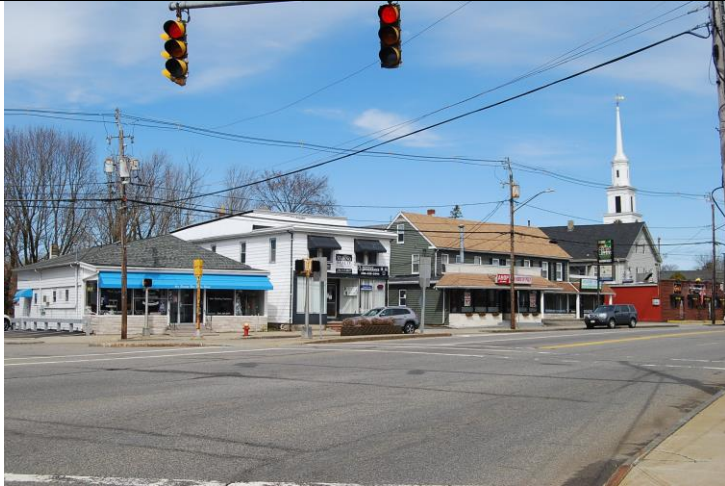
View looking northwest. L to R: 175 Main Street; 169-171 Main Street; 155-163A Main Street; 145-147 Main Street. 12 West High Street partially visible below church steeple.