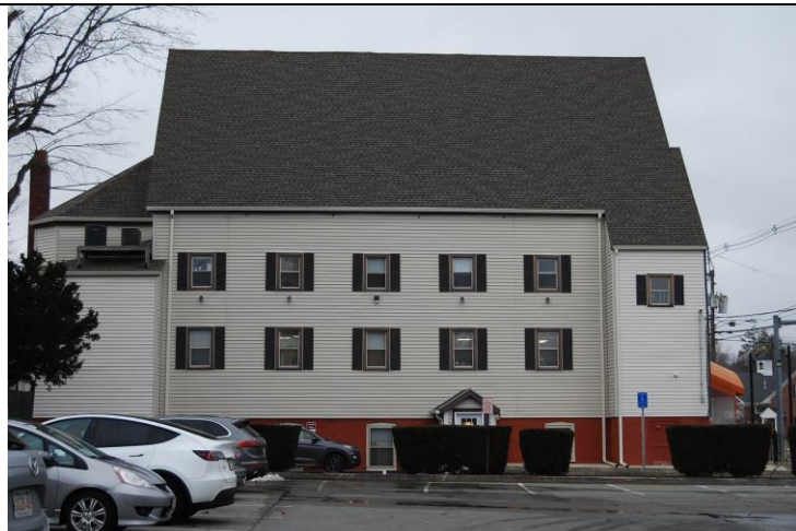
View looking northeast at south elevation of 185 Main Street. Note apse remains at west end of building.