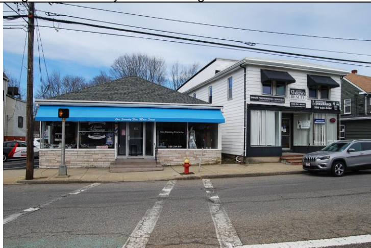
View looking northwest toward 175 Main Street (left) and 169-171 Main Street (right).