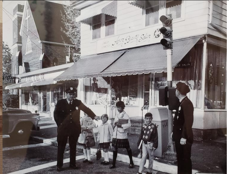
Right to left: 169-171 Main Street, 175 Main Street, 185 Main Street (St. Michael's Church). 1960s?