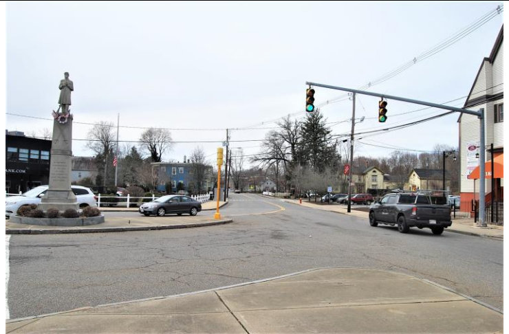
View looking southwest from Main Street toward West Main Street. Soldier's monument visible at left. 185 Main Street partially visible at right.