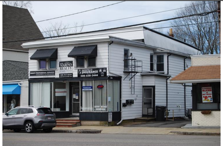
View looking southwest toward 169-171 Main Street.