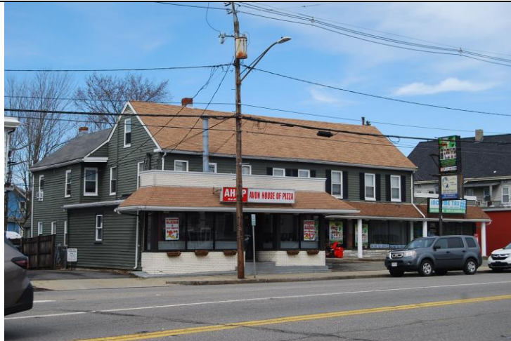
View looking northwest toward 155-163A Main Street. Original house may be the front-gabled section at left rear.