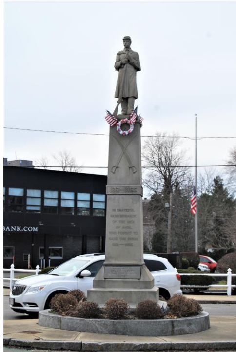
View looking south toward Soldiers' Monument.