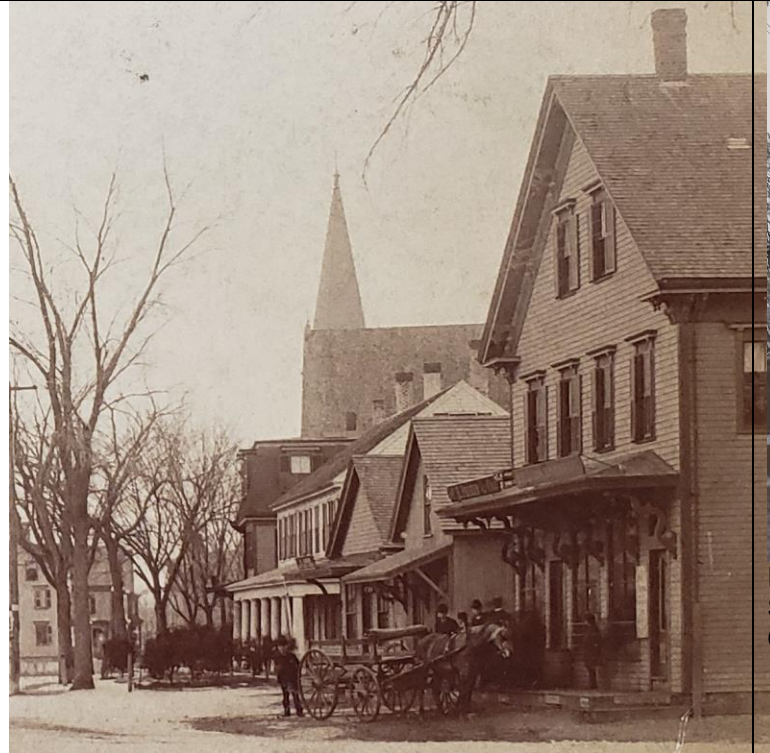
View looking south from the intersection of West High Street and Main Street, circa 1888. 12 West High Street visible in foreground in its original location. White building at center is 155-163A Main Street. St. Michael's Church at 185 Main Street is partially visible in distance.