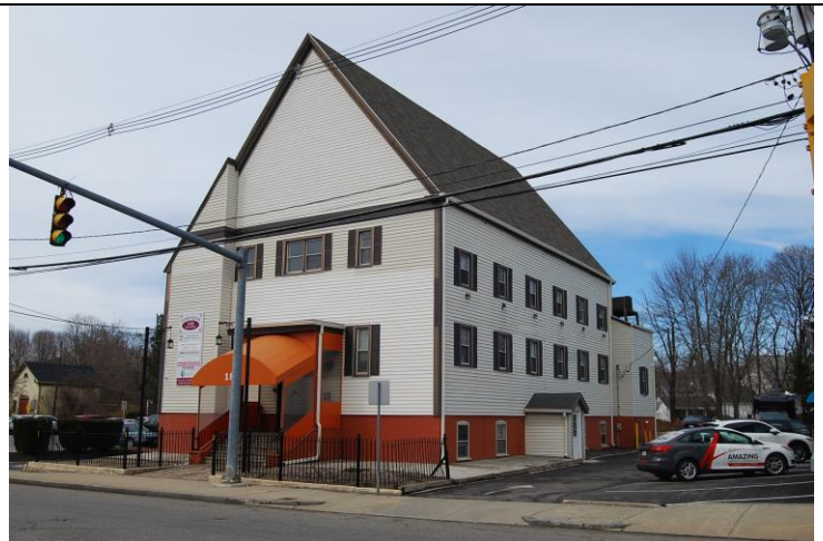
View looking west toward 185 Main Street.