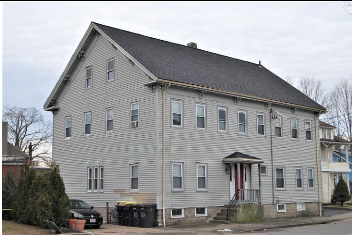
View looking southwest toward 12 West High Street.