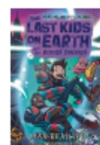
The Last Kids on Earth and the Monster Dimension Max Brallier