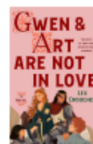
Gwen & Art are Not in Love Lex Croucher