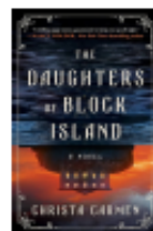
The Daughters of Block Island Christa Carmen