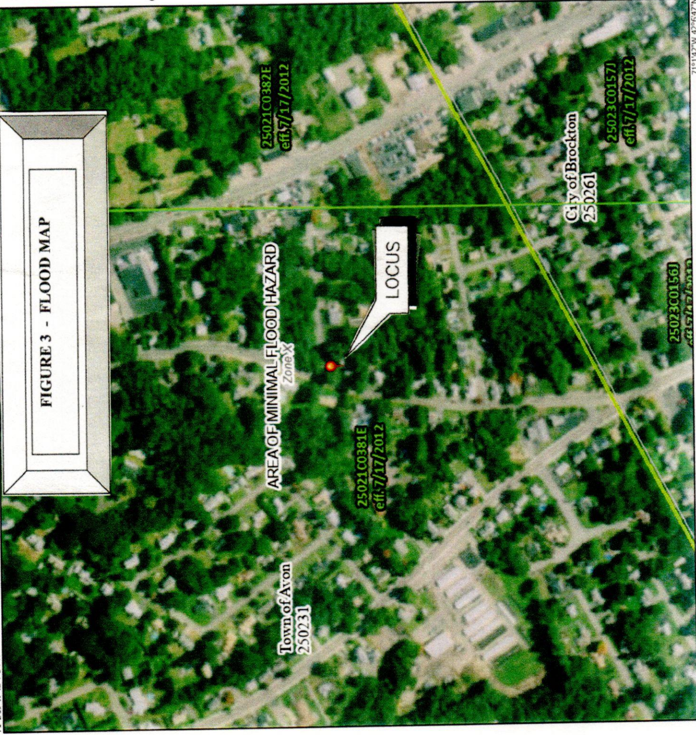
FIGURE 3 - FLOOD MAP