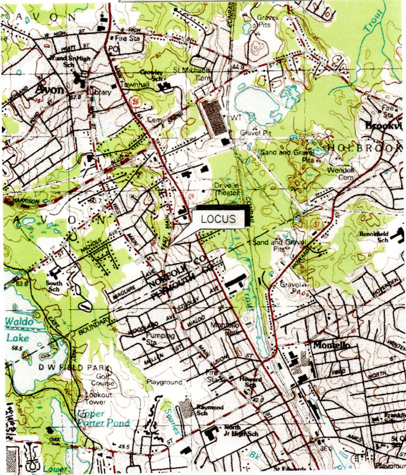
FIGURE 1 - SITE LOCUS